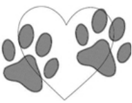
Paw prints and heart