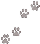
Paw print trail