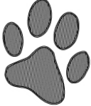
Paw print 1