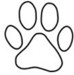
Paw print 2