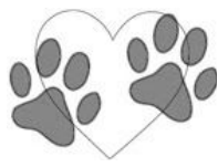
Paw prints and heart