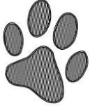
Paw print 1