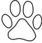
Paw print 2