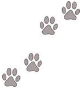
Paw print trail