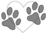
Paw prints and heart